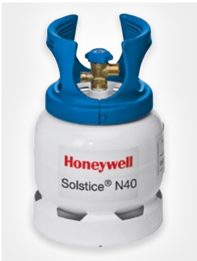
Honeywell's Solstice N40 (R-448A)